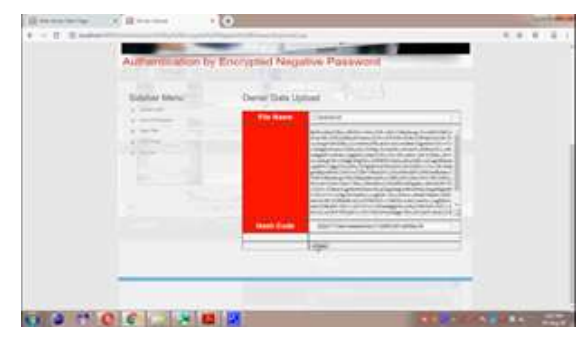
Fig 4:Data Upload Page