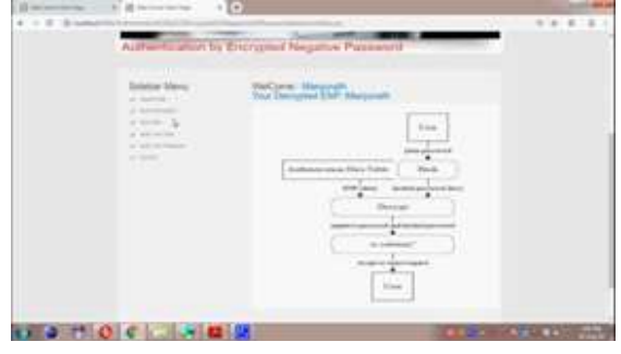
Fig 3:Home Page